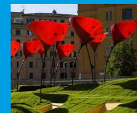
POTENTIAL OF CROMAC ST AND SQUARE